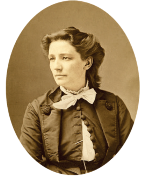
In 1872, Victoria Claflin Woodhull was the first female candidate for President of the United States. An activist for women's rights and labor reforms, Woodhull was also an advocate of free love, by which she meant the freedom to marry, divorce, and bear children without government interference.

If you would like to run the above article, please feel free to do so. I can also provide images to accompany it. If you're interested in