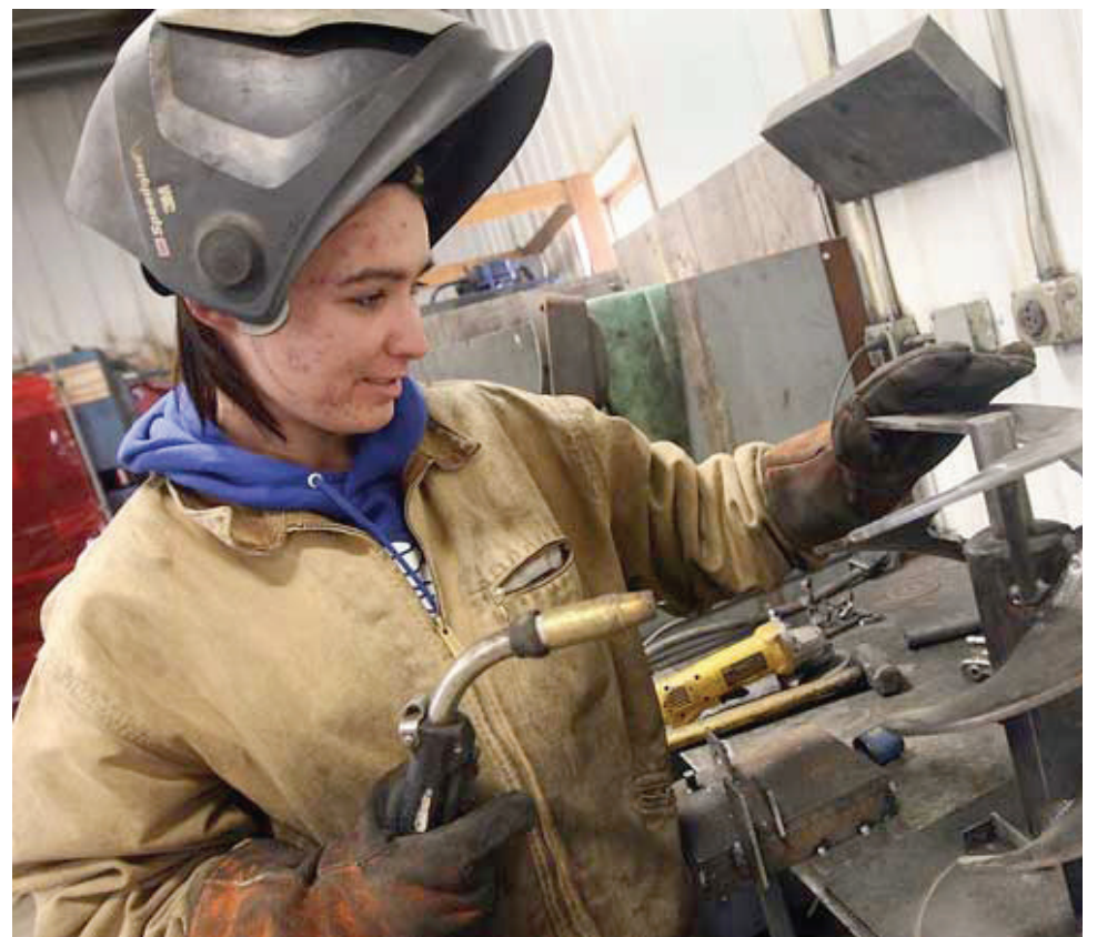
155 (Fresno, Calif.) Local 377 (San Francisco) and Local 378 (Oakland, Calif.)

The University of Iron represents 3,000 apprentice and 19,500 journeymen ironworkers throughout California, Nevada and Arizona who are members of Iron Workers Local 229 (San Diego), Local 118 (Sacramento, Calif.), Locals 416 and 433 (Los Angeles and Las Vegas), Local 75 (Phoenix), Local